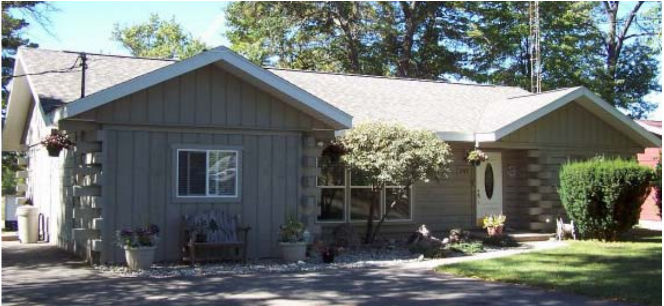
Above: HLPOA's new office headquarters.

In addition to the ad for an office assistant that appeared in the letter, we also placed ads in the Roscommon Herald News and Houghton Lake Resorter . The response to these ads was amazing, and several potential candidates were identified. A second round of interviews will take place in October, and selection will be made shortly thereafter. We look forward to your continued support as we move forward and will keep you posted on the opening of our new office space. Thank you.